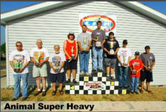
Animal Super Heavy