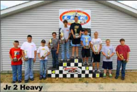
Jr 2 Heavy