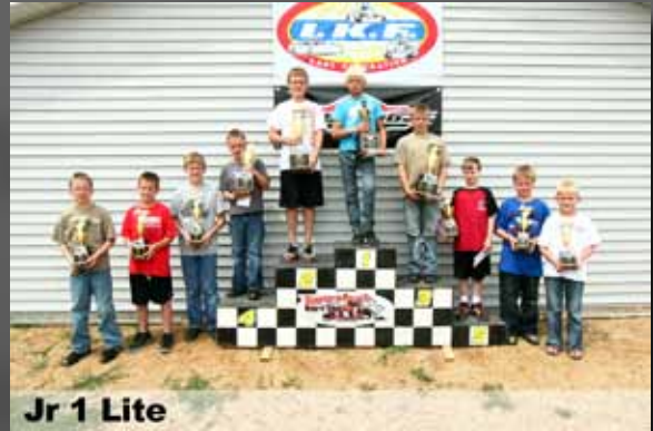
Jr 1 Lite