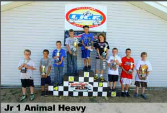
Jr 1 Animal Heavy