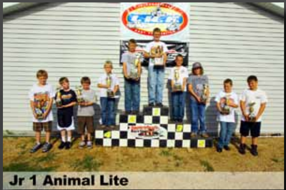
Jr 1 Animal Lite