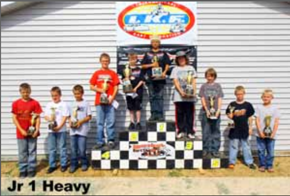
Jr 1 Heavy