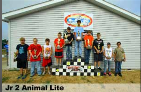
Jr 2 Animal Lite