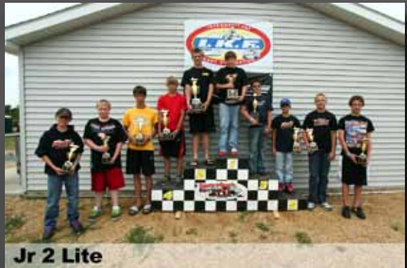
Jr 2 Lite