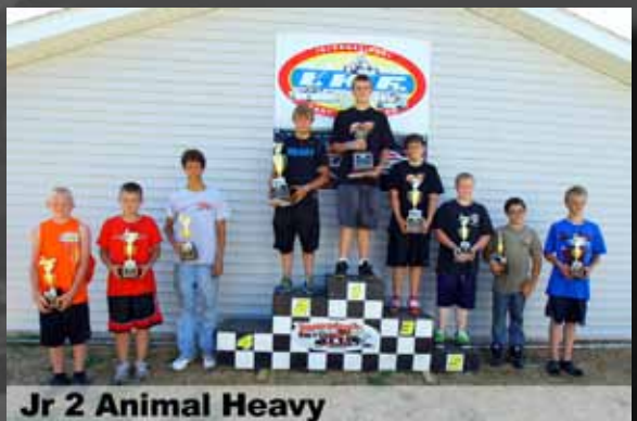
Jr 2 Animal Heavy